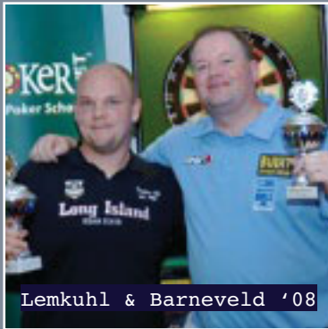
Lemkuhl & Barneveld '08