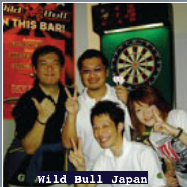
Wild Bull Japan